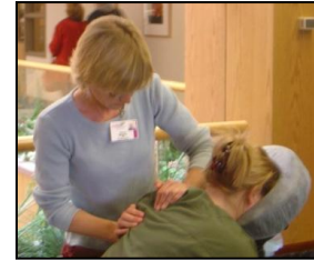
UW-Madison Integrative Medicine Program

Massage has been found to be similar to exercise in improving back pain and function. In a study on chronic low back pain, 401 patients were assigned to one of three treatment groups: 1) structural massage, 2) relaxation massage and 3) usual care. After 10 weeks, patients who received either type of massage could move better and had fewer symptoms than those who received usual care. These benefits lasted up to six months. One type of massage was not better than the other.