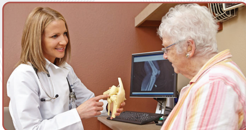
Based on post-residency graduate surveys, virtually all alumni are using OMT in their practice.