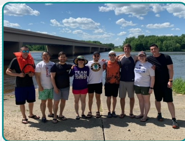
Monroe resident retreat 2022

The rural training environment allowed me to form excellent mentor/mentee relationships with my attendings. Because of these reasons, I have elected to stay on at SSM Monroe as an attending. I am so grateful to have trained here and know I would not have excelled as much in a more urban environment."