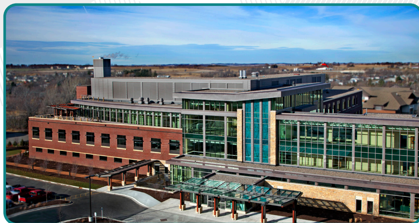
SSM Health Monroe Hospital

The Monroe Family Medicine Residency Program is committed to providing compassionate and comprehensive rural osteopathic primary care training that is rigorous and is personally fulfilling to the residents who train here.