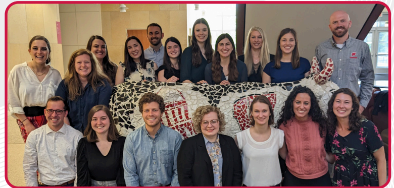
Class of 2026