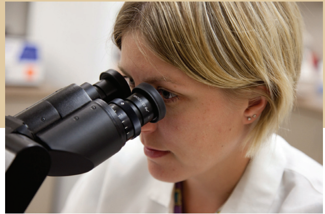
WREN Clinic Locations