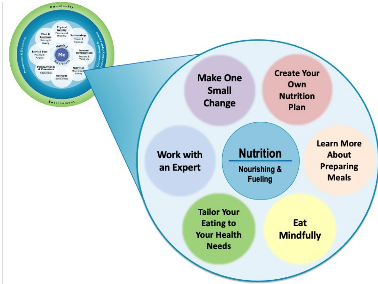
Figure 5. Subtopics within the Nutrition Circle of Self-Care

Patients are more likely to follow nutrition recommendations if they hear them directly from a clinician and if clinicians can speak to following those recommendations themselves