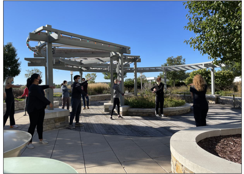
A group practices Tai Chi in the courtyard at East Madison Hospital.