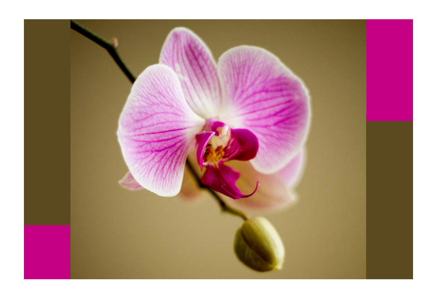
University of Wisconsin School of Medicine and Public Health Department of Family Medicine