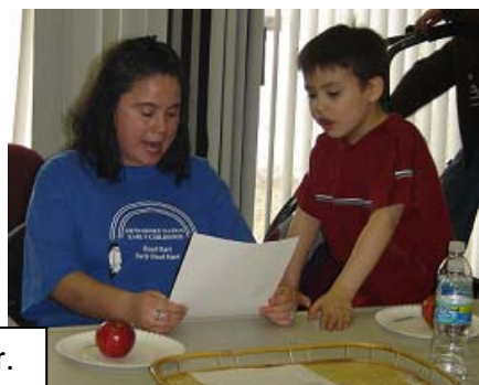
Reading the recipes together.