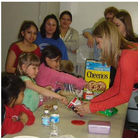
An assembly line making trail mix.

Menominee families curbed their cravings by learning how to prepare healthy snacks. The kids got to play fun games, while moms and dads learned why planned snacking is an important part of a healthy diet. Watch for this activity coming soon to your community!