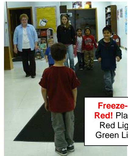
Freeze-it's Red! Playing Red Light! Green Light!