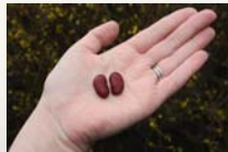
ScottShawyer © Flickr