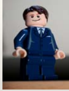
Spitznick Weiss © Flickr

It is the right thing to do, as data needs to come from the real world, even though we don't have the time or resources to do it ourselves.