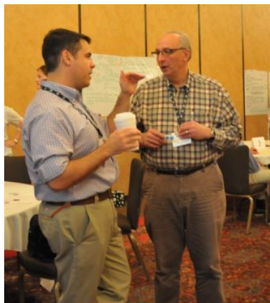
Conference participants engaging in discussion